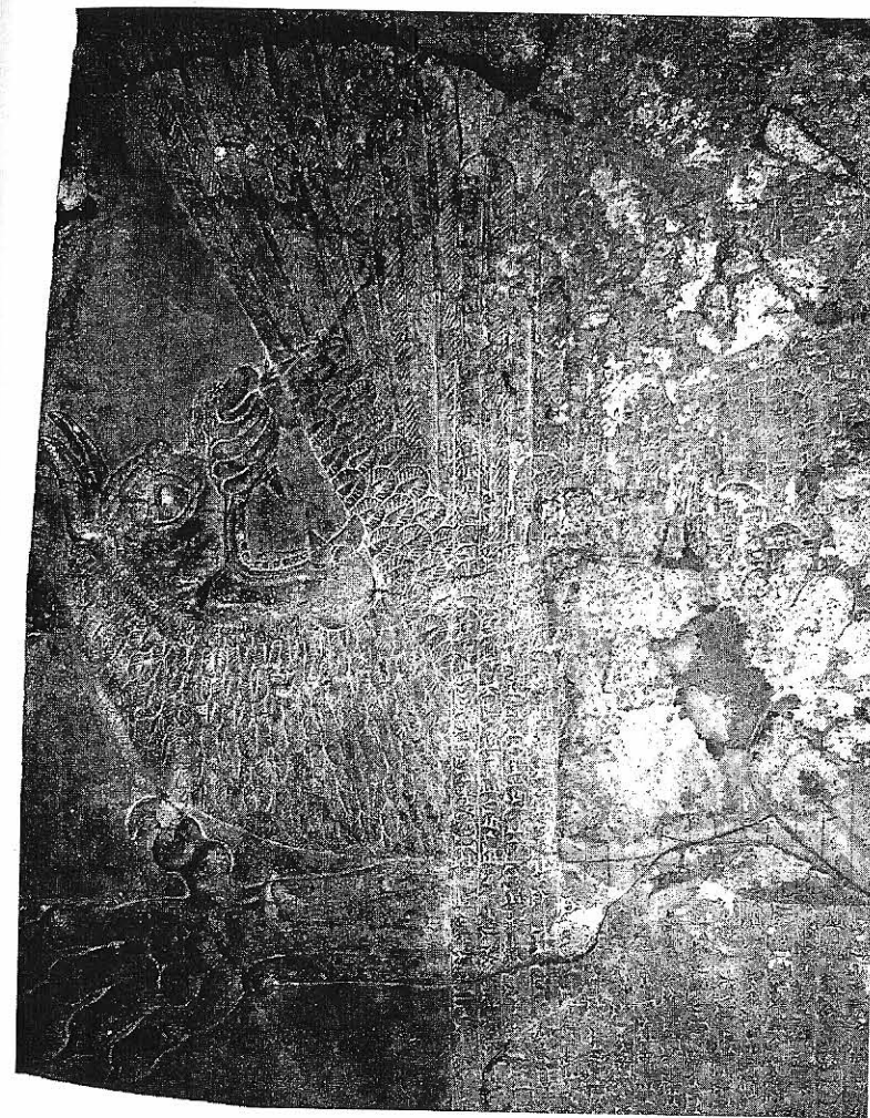
Figure 3.6 The Anzu bird fought the heroic god Ninurta for possession of the Tablet of Destinies. This stone carving of the cosmic battle was erected in the temple of Ninurta at Kalhu, c. 875 BCE, and is now in the British Museum.

The gods are powerless without the Tablet, and Anzu is in complete control of the destiny of the world. Several gods refuse the challenge of combating Anzu, until the warrior-god Ninurta rises to the occasion. The two foes engage in a mighty cosmic battle. Anzu, with the Tablet of Destinies in his possession, is able to