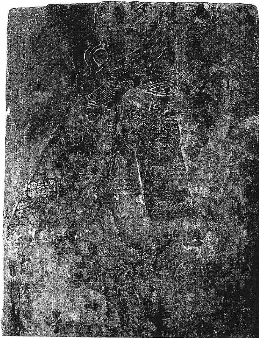
Figure 3.3 The seven antediluvian sages were thought to have been half man, half fish. This bas-relief was erected in the temple of Ninurta in Kalhu, c. 875 BCE, and is now in the British Museum.

Scholarship itself was deemed to have been bequeathed to mankind in the primordial past. Mesopotamian spells and incantations “creat[es] magic by harking back to a primeval time” (Livingstone 1999:131). And according to the late 2nd millennium Myth of Adapa and other sources, Ea, the god of wisdom, sent seven semi-divine sages to the antediluvian city of Eridu in order “to disclose the design of the land” (line 2; Dalley 1989:184). Esarhaddon’s son Ashurbanipal (668–27 BCE) recalls this tradition in one of his own self-laudatory royal inscriptions: