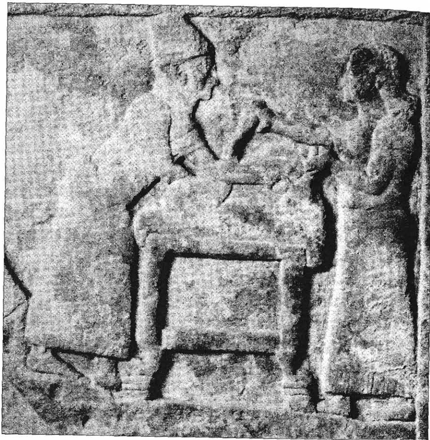
Figure 3.4 A baru inspects the entrails of a the sacrificial ram, depicted on a bas-relief from Ashurnasirpal II's palace at Kalhu, c. 875 BCE, now in the British Museum.