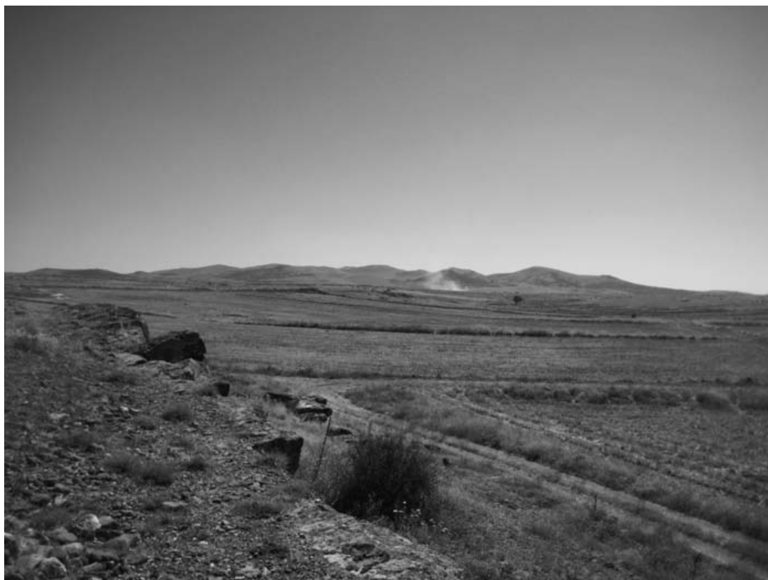
Fig. 4 The line of hills to the east of TOPADA.

conflict with the Parzutean and the eight kings. After the defeat of the Parzutean, Wasusarma was in control of the area to the west of Nevşehir and also south of the Kızıl Irmak.