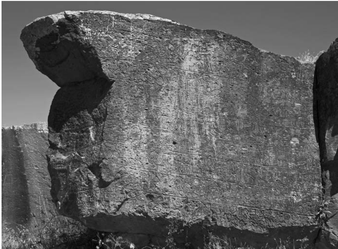
Fig. 2 The inscription of TOPADA at 11.00 am on 5 September 2009, photograph by T. Oshima.

from there. Due in part to its highly idiosyncratic use of archaizing or unusual sign-forms, it is extremely difficult to interpret. In this regard it shares many characteristics with the SUVASA inscription in particular, but also with other “north Tabalian” inscriptions, and the earlier inscriptions from the “Hartapu”-group at Karadağ, Kızıldağ and Burunkaya. 58 It will be of use to review some of the crucial passages of this inscription, which has been edited several times. 59 The following presents a close reading line by line, with epigraphic, grammatical and interpretive discussion, in an attempt to build a firmer picture of the inscription’s historical and geographical context. 60