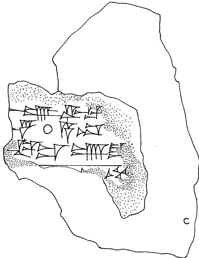
BM 98572, Reverse